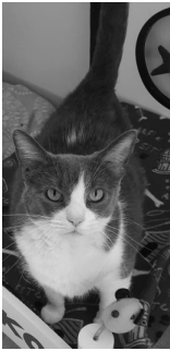
November 2022 Newsletter #127